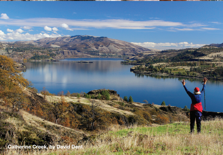
Catherine Creek