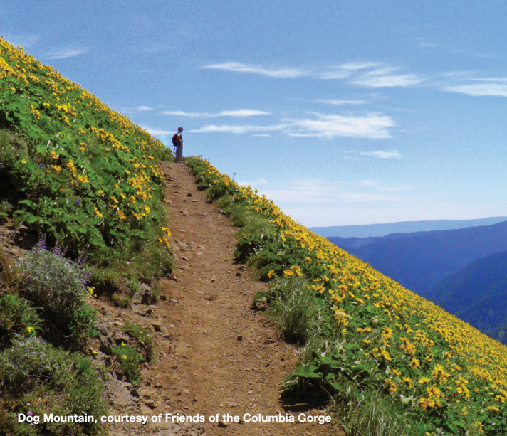
Dog Mountain