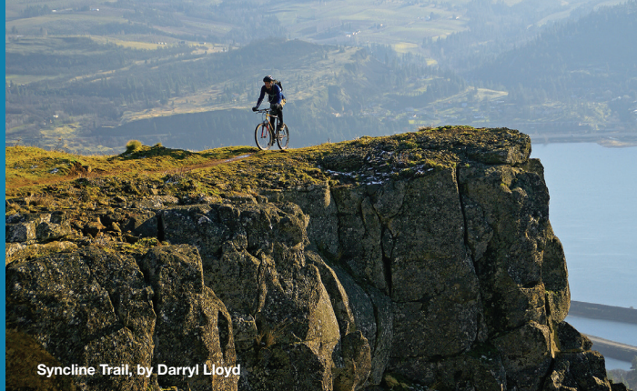
Syncline Trail

Established in 1986, the Columbia River Gorge National Scenic Area protects nearly 293,000 acres of trails, forest, waterfalls, parks and historical sites within this spectacular river canyon.